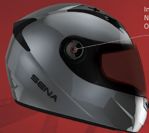
Intelligent Noise-Control™ On/Off Button