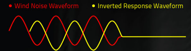
Wind noise canceled out by opposing waveform.

Simply snap in the Intelligent Noise-Control™ module and touch the "On" button to activate the INC™ system. This plug-and-play module analyzes the sound information from the array of four networked microphones and adjusts to phase out harmful helmet noise in real time. You can also switch to ambient mode to hear external sounds and conversations without removing your helmet when you pull over to fuel up or take a rest break.